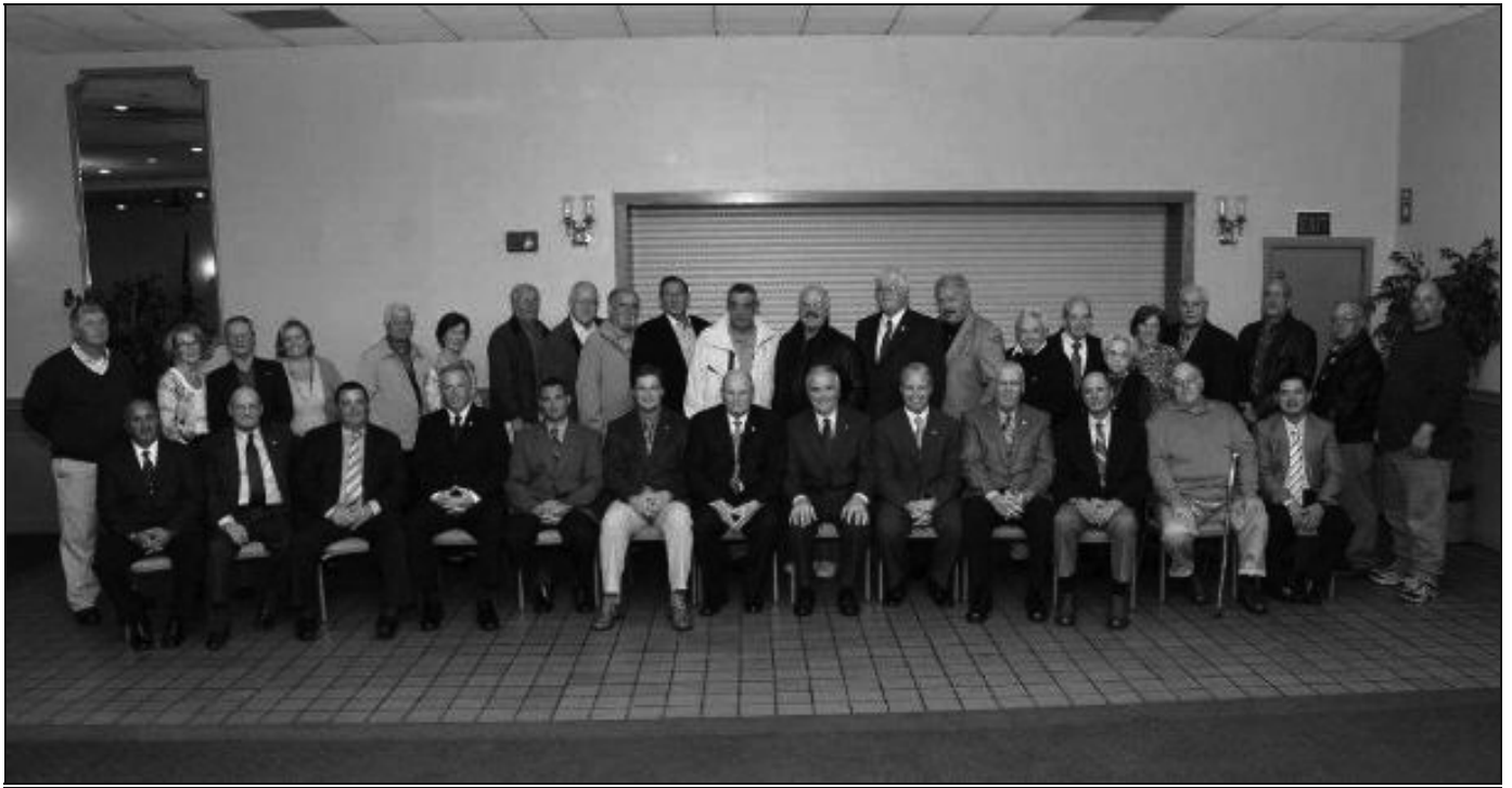
Pictured above are our 50-Year Members with Family and Staff at the October Body Meeting