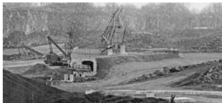
Baldwin Cranes 999 Manitowoc at work in Brox Industries Dracut Quarry

This November we are faced with one of the most important presidential elections most of us will ever be part of. If we want to continue getting the wages and benefits that we all enjoy having a Union presence in the work place, we NEED to get John Kerry elected. I ask that everyone get out and vote especially our Maine and New Hampshire members.