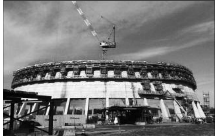
The first Cooling Tower at Brayton Point approaches 100 feet on its way to 500 feet.

Kiewit continues work on the Brayton Point closed loop cooling tower project. The towers have started to go up and will be up by the end of the year. Since the writing of the last Newsletter, Kiewit has been awarded the contract to build a new scrubber at Brayton Point for Dominion. This project should be about $400 million and will start this year.