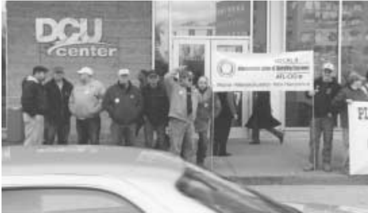
Local 4 members showing support for Deval Patrick and Tim Murray at a rally at the D.C.U. Center in Worcester.

May you and your family have a safe and healthy Holiday Season.