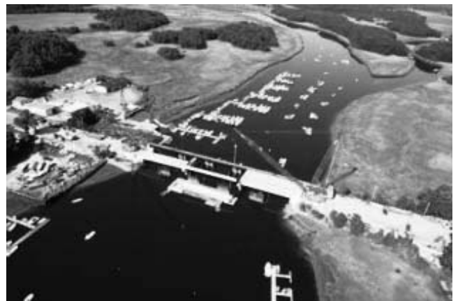
A Picture of the tandem 4100 Ringer Crane picks at the Newbury Parker River site.

As always if there is anything I can do for you don't hesitate to call. I wish you all the best.