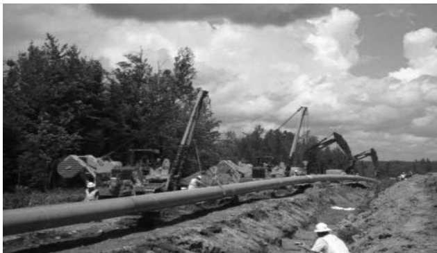
Schmid Pipeline Construction and members of the Operating Engineers Local 4 laying 30" pipe from the St. Croix River to the Baileyville Compressor Station in Washington County, Maine for Maritimes Northeast Phase IV project.

In closing, I look forward to working with all of you now and in the future and I hope everyone has a great fall season.