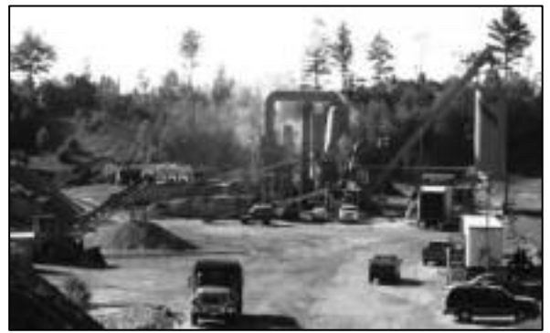
Lane Construction's new state-of-the-art facility in Washington, Maine

There is work on the horizon with Maritimes Northeast's plan on expanding the pipeline system, with the looping of 35 miles of 36" in Washington county, and 5 miles of 36" in Richmond. No start date has been given as yet. We have several operators chasing pipeline work out in the mid-west and in the deep south looking to work in Maine for a change, and hopefully this will happen soon. The $750 million Calais LNG facility, along with 42 miles of 24" pipeline to the Baileyville compressor station, has been put in the hands of FERC, (Federal Energy Regulation Commission) for approval, which could take several months for an answer. Also, the $1.7 billion Wiscasset Tidal Storage Generation facility near the old Maine Yankee site has also been submitted to FERC for approval. This project includes 15 million cubic yards of rock excavation and up to five years of work. If one or both of these jobs are approved, we will have plenty of work for years to come.