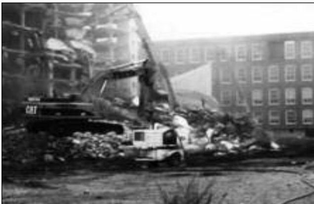
Testa Corp. demo job in Lowell making room for the new Court House

If there is anything I can do for you, don't hesitate to call. As always, I would like to wish all of you and your families a happy, healthy and safe fall season!