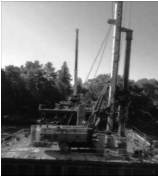
Donaldson's drill rig on Barletta's Hynes Bridge job in Amesbury

There are a few jobs in the area that have put some of our members to work. UMass has their Nanotechnology Building with NCI doing the site work, and a couple of our crane rental companies have been in and out on a steady basis. Dow is working on the Lowell General Hospital and the Rt. 97 Groveland Bridge. The Lawrence Duck Bridge and the Tyngsboro Bridge are both being restored by S&R. Barletta has a Manitowoc 888 clamming on Hynes Bridge in Amesbury, and Donaldson has just moved it to begin the caissons. Cairns is moving along on Rt. 93 exit 3 in Londonderry, NH. This project is on the down swing as they are getting closer to completion with Brox doing the paving and Pihl is on the tailend of their Lawrence Rt. 28 bridge job. D.W. White has a good sized road job in Tyngsboro that has recently begun. ET&L has a landfill in Groveland that has a few operators on, and they also have the Marston St. Bridge job going in Lawrence.