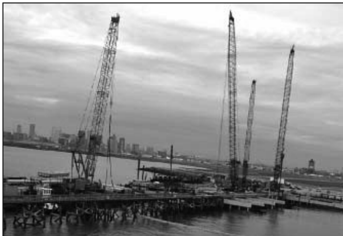
J.F. White's Runway Safety Improvement Project at Logan Airport

Here are some ongoing projects in the north of Boston area. In Revere, Suffolk Construction, A.A. Will, Blakeslee Prestress, Bay Crane and NASDI are currently underway on the construction of a $50 million M.B.T.A Wonderland parking garage. At Logan Airport, Construction Management and Consulting (C.J. Mabardy) and James Flett are in the early stages of building a state-of-the-art Massport Authority bus terminal. J. Derenzo Co. and Valley Crest Landscaping are finalizing the reconstruction of a roadway improvement project. Many Operating Engineers are currently employed at these sites. In Charlestown, Baldwin Crane is present at Route 99 finalizing the erection of a 400 foot mega wind turbine for the M.W.R.A. MacKay and NEFCO were also at this location. Work at the Partners/Spaulding Rehab continues to move forward. This ten story hospital facility is located in the heart of the historic navy yard. Barletta, G. Donaldson, Bay Crane and Shumacher Landscape are currently constructing a $25 million pedestrian footbridge at North Bank. Several Operating Engineers are also employed at these sites.