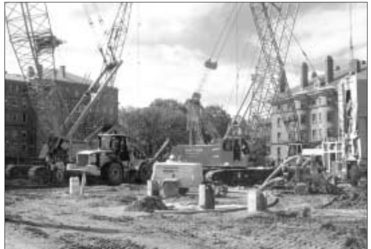
East Coast Slurry is pushing hard to complete the project at Harvard University.