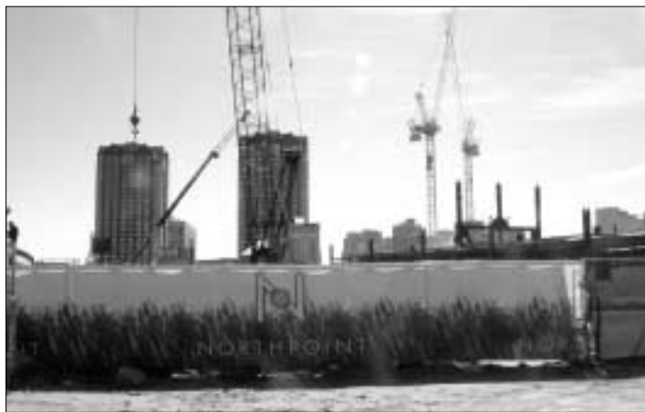
North Point Park, Cambridge Capco is setting steel with the help of their two tower cranes. Builders Resource Inc. is setting steel on another building as this project goes forward.

Logan Airport has several ongoing projects that will be completed this year. The Central Parking Garage is moving toward the finish line. The mild winter has helped move this project forward avoiding weather delays. Barletta Corporation should complete their three ongoing projects at the Airport this year. McCourt Construction has resumed work on the new runway project. Testa will be doing a demo job on Harborside Drive this spring. J. F. White has a $7.6 million project to build two buildings at North Cargo. Maverick Square will get a $30 million face lift by the J. F. White Company this year. Construction on this site has been off to a very slow start so far.