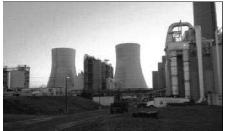
Work on the Brayton Point Cooling Towers is coming to an end. It has been a good job for Local 4

Kiewit continues work on the cooling towers at Brayton Point. They have also begun work on the scrubber project. Work has just started and this will be another job that provides some good work opportunities for the men and women of Local 4, including our 4E members.