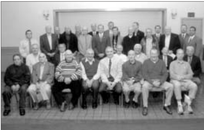
Pictured above are the fifty-year members who attended the body meeting on November 16 th at Florian Hall in Dorchester.

I again wish you all the best in the coming New Year.