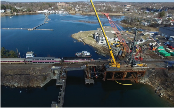
The MBTA Annisquam Bridge job in Gloucester.