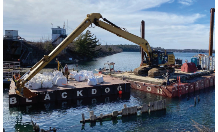
Black Dog Diving doing the underwater excavation at the MBTA Annisquam Bridge in Gloucester.