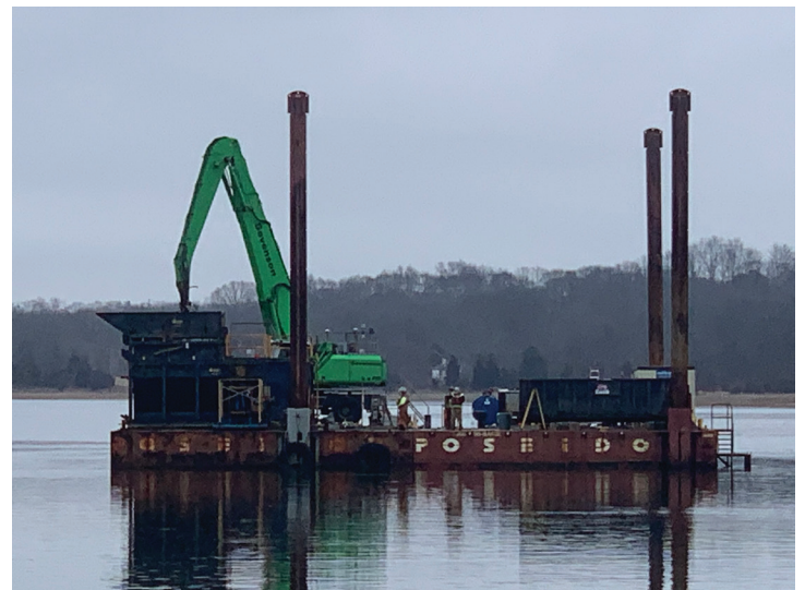
Sevenson working in New Bedford Harbor.