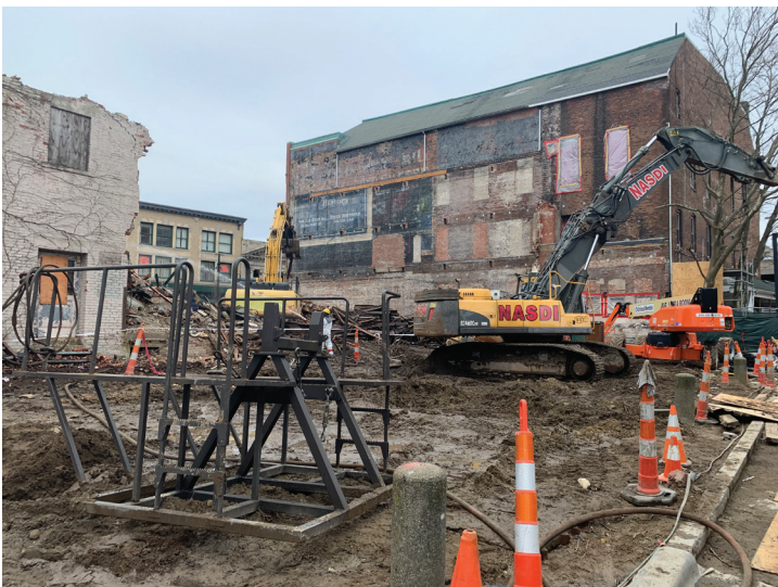
NASDI taking down a building in Brockton.